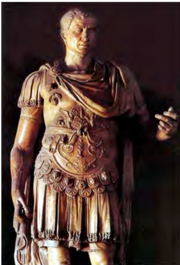
Julius Caesar Statue