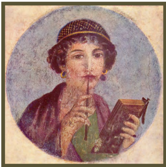
Young Roman Woman- From a fresco in Pompeii

Many considered Mathew Brady to be the father of photojournalism. Brady photographed only one actual battle choosing instead to focus on scenes of men living in the camps and dead after the battle. His choice to focus on these elements was meant as a statement on the living cost of war.