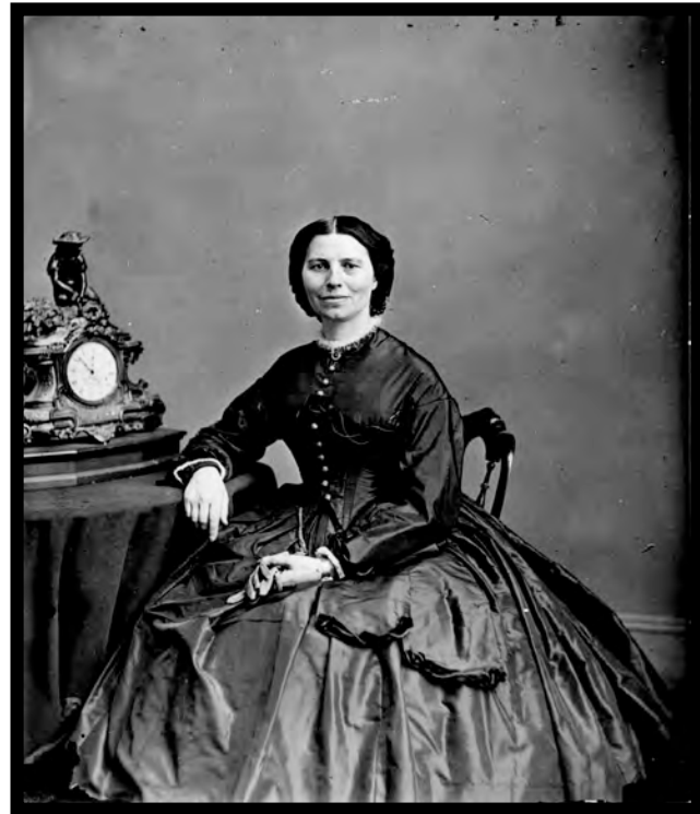
Clara Barton